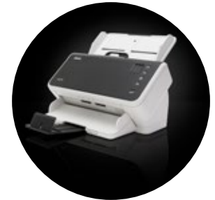
Alaris S2050/S2070 Scanners