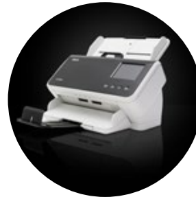
Alaris S2060w/S2080w Scanners